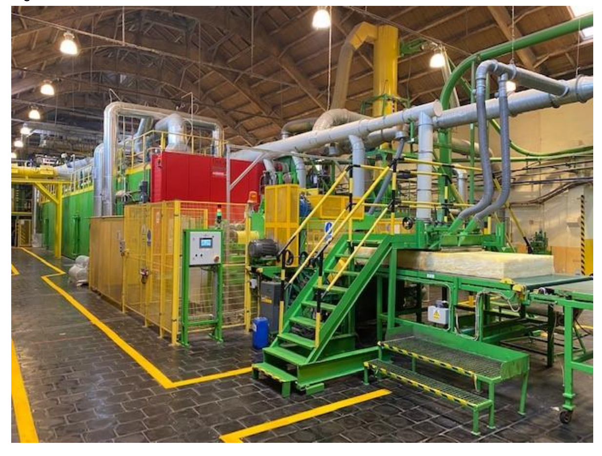
Fig. 1 Production line

Detailed characteristics of each type of product are available on the manufacturer's website: http://www.rotaflex.cz/, where there is also a downloadable product catalogue.